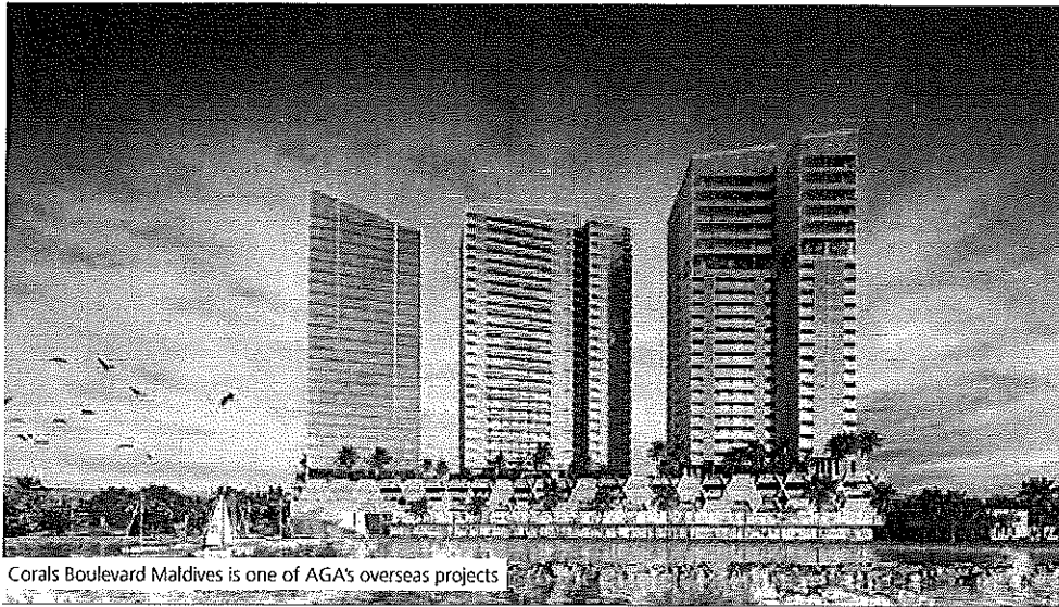
Corals Boulevard Maldives is one of AGA's overseas projects