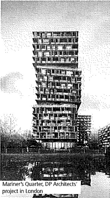
Mariner's Quarter, DP Architects' project in London

a 750,000sqm mixed development project in Bangkok, a size that is very rare in Thailand.